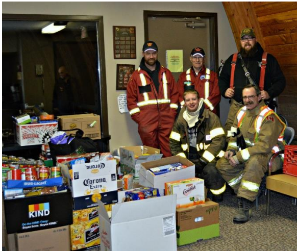
Fire Department bringing in donations