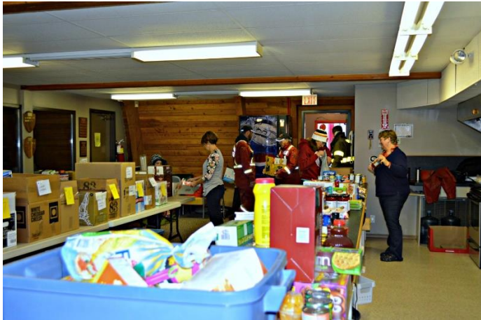
Organizing for the Hampers