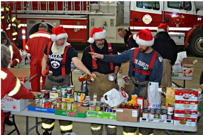
Fire Department sorting the collected food

The Acme and District Food Bank would like to THANK the Acme Fire Department and everyone who donated during the CANDY CANE RUN in December. The Community Support was overwhelming!! ($580 and 1320 pounds of food!) HANK YOU to the Acme Bank of Montreal Staff who collected for us. A big THANK YOU as well, to the Acme School who collected 'silver' & food at the school Christmas Concert. We want to give a shout out to Ember Resources for their generous donation! To those of you who continually give financial donations...THANKS! Without your generous donations, we would not have been able to make our Christmas hampers. The Candy Cane Run has been going for 15 years in our community!