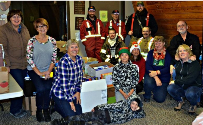
Acme Food Bank Volunteers