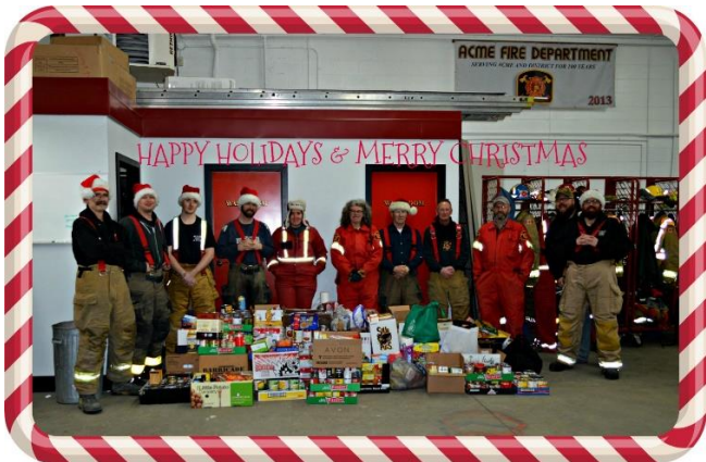
Acme Fire Department Members