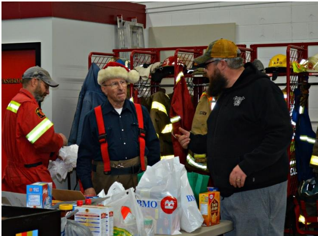
Sorting the donations